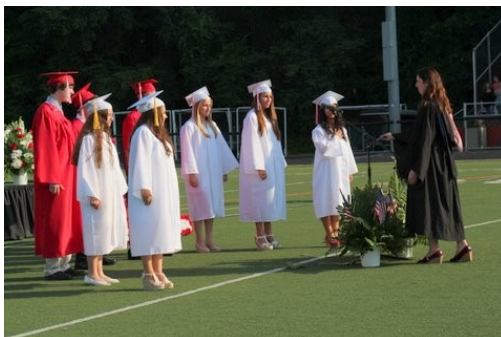
Left, grads during ceremony. Right, the stage.